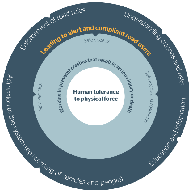
Figure 2 » ‘The Safe System’ 3

The uptake of safer vehicles and key safety features is improving due to a range of measures, such as the mandating of electronic stability control (ESC) for passenger cars and plans to mandate ESC in light commercial vehicles. However, more can be done to ensure crash protection and other safety features are a part of every new car design.