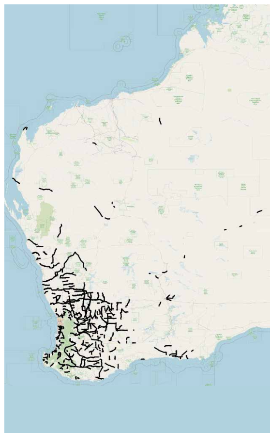
Map of roads prioritised for the business case.